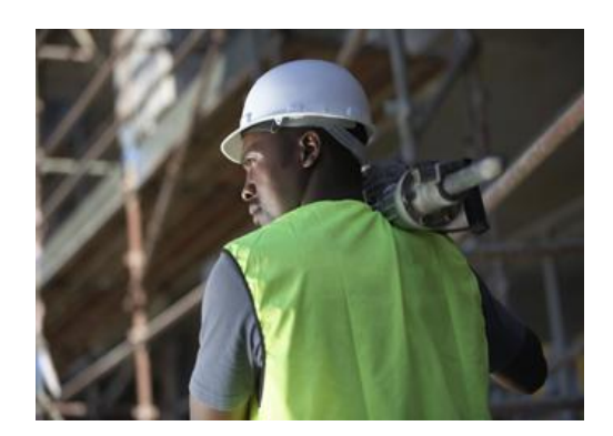
Laura is calling in gas mechanics to restore service in a residential neighborhood

Laura knows from experience that 1 mechanic can relight 10 houses in an hour. How many gas mechanics need to come in to restore all the customers within an hour after the system is repaired?